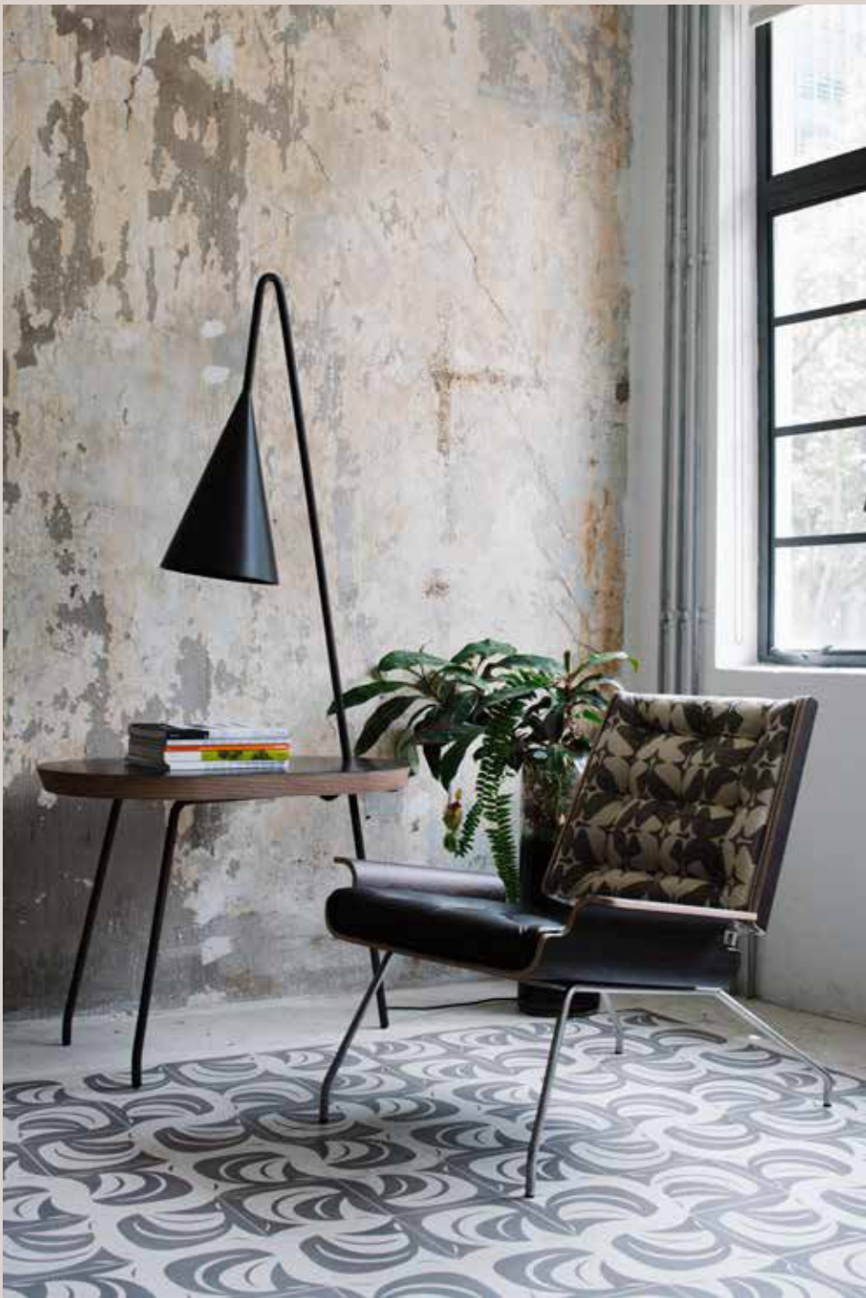
ASIAN AT HEART, GLOBAL IN VIEW